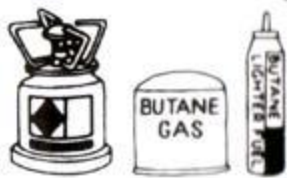
Compressed Gas Cylinders

Corrosives such as acids, alkalis, mercury and wet cell batteries